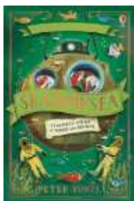
The last of the Cogheart Adventures